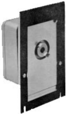
One Slidewire. 1-7/8" Deep.