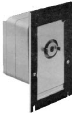
Two Slidewires. 2-7/8" Deep.