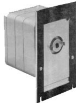
Three Slidewires. 3-7/8" Deep.